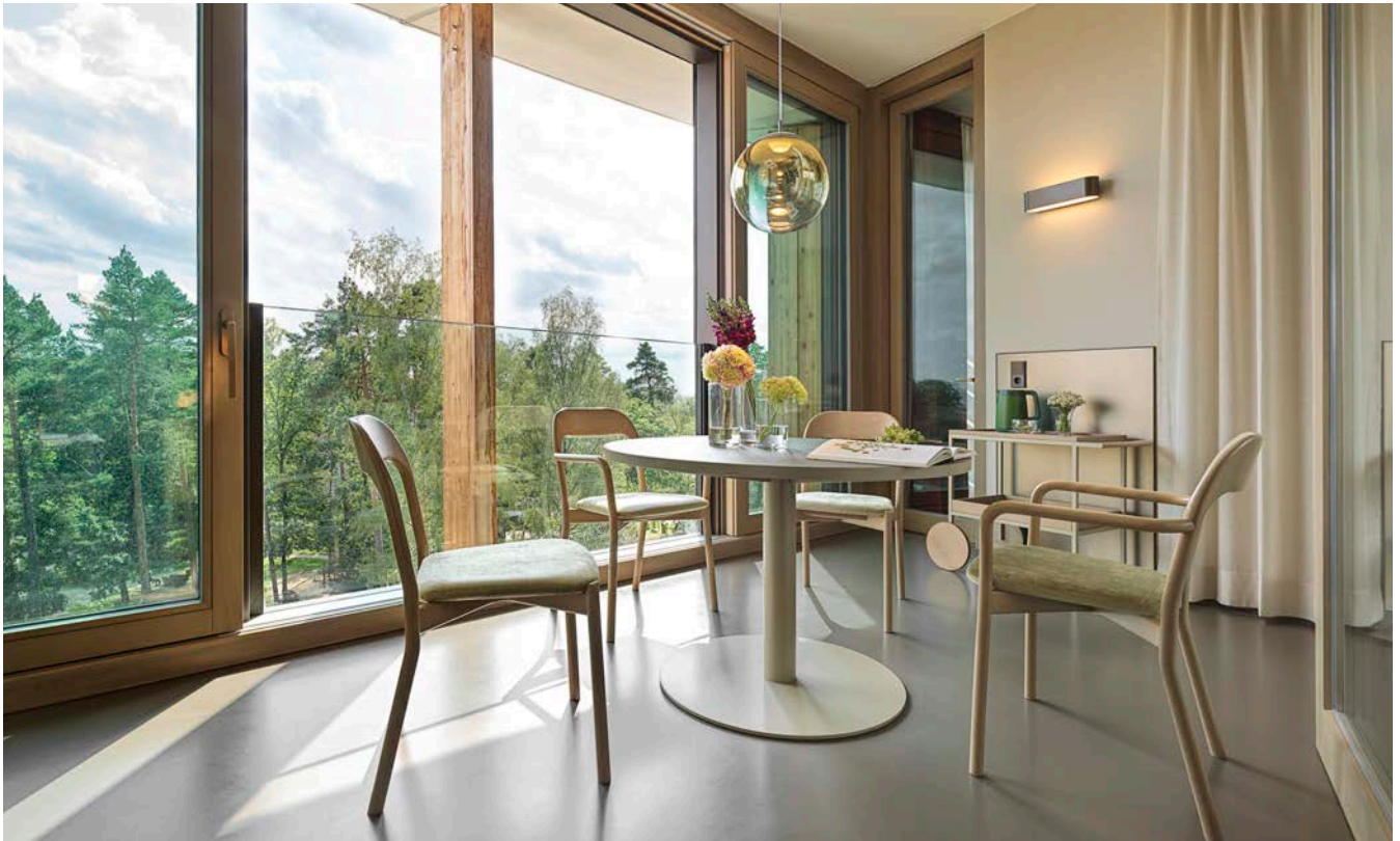
Light-flooded verandas always connect two rooms