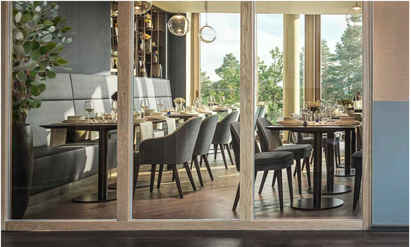
'Matteo' restaurant