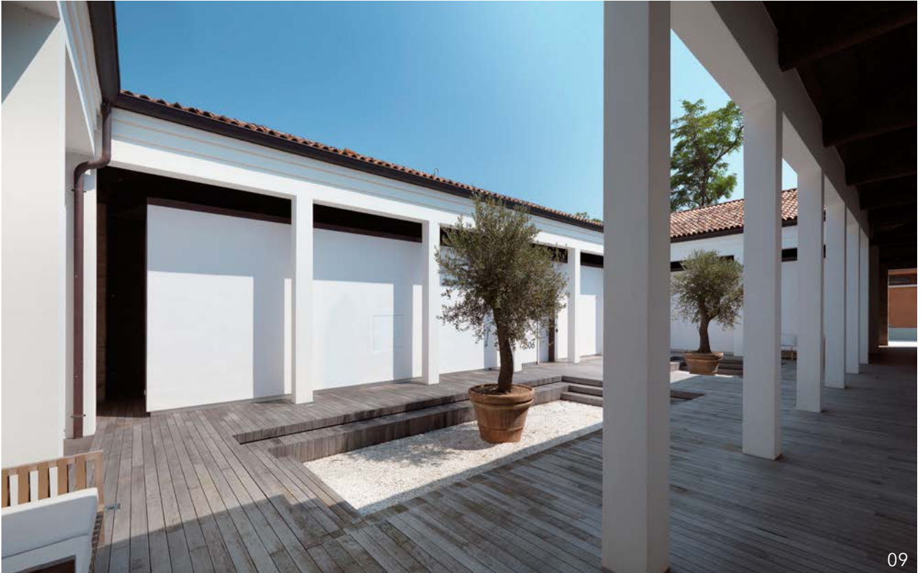
"LA RESIDENZA" VIEW FROM INSIDE ON THE PRIVATE GARDEN WITH POOL AND VENICE' LAGOON