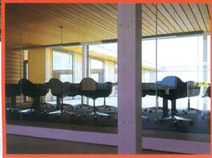
firm: matteo thun & partners site: kösching, bavaria