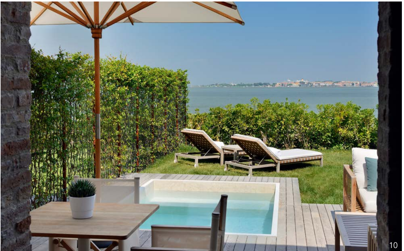
"LA RESIDENZA" VIEW FROM INSIDE ON THE PRIVATE GARDEN WITH POOL AND VENICE' LAGOON