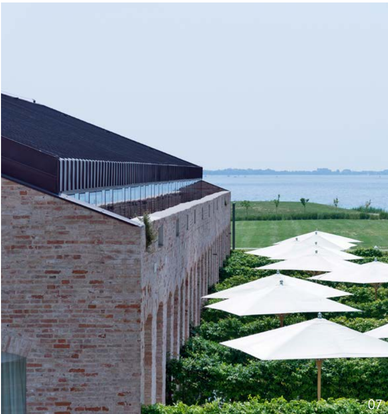
"LA MAISONNETTE" RENOVATED ACCORDING TO THE "BOX IN THE BOX" CONCEPT